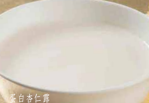
nd milk with egg white erved with fried Chinese doughunt