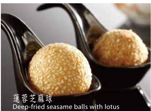
seeds paste filling