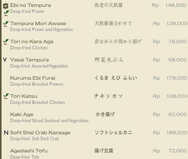
Ebi no Tempura Deep-fried Prawn