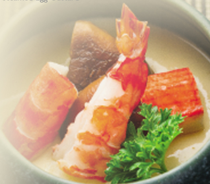
Chawan Mushi Steamed Egg Custard