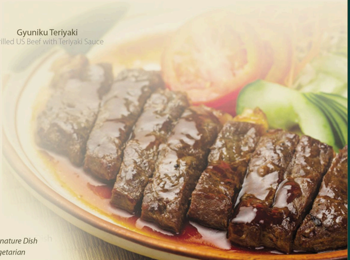
Gyuniku Teriyaki Grilled US Beef with Teriyaki Sauce