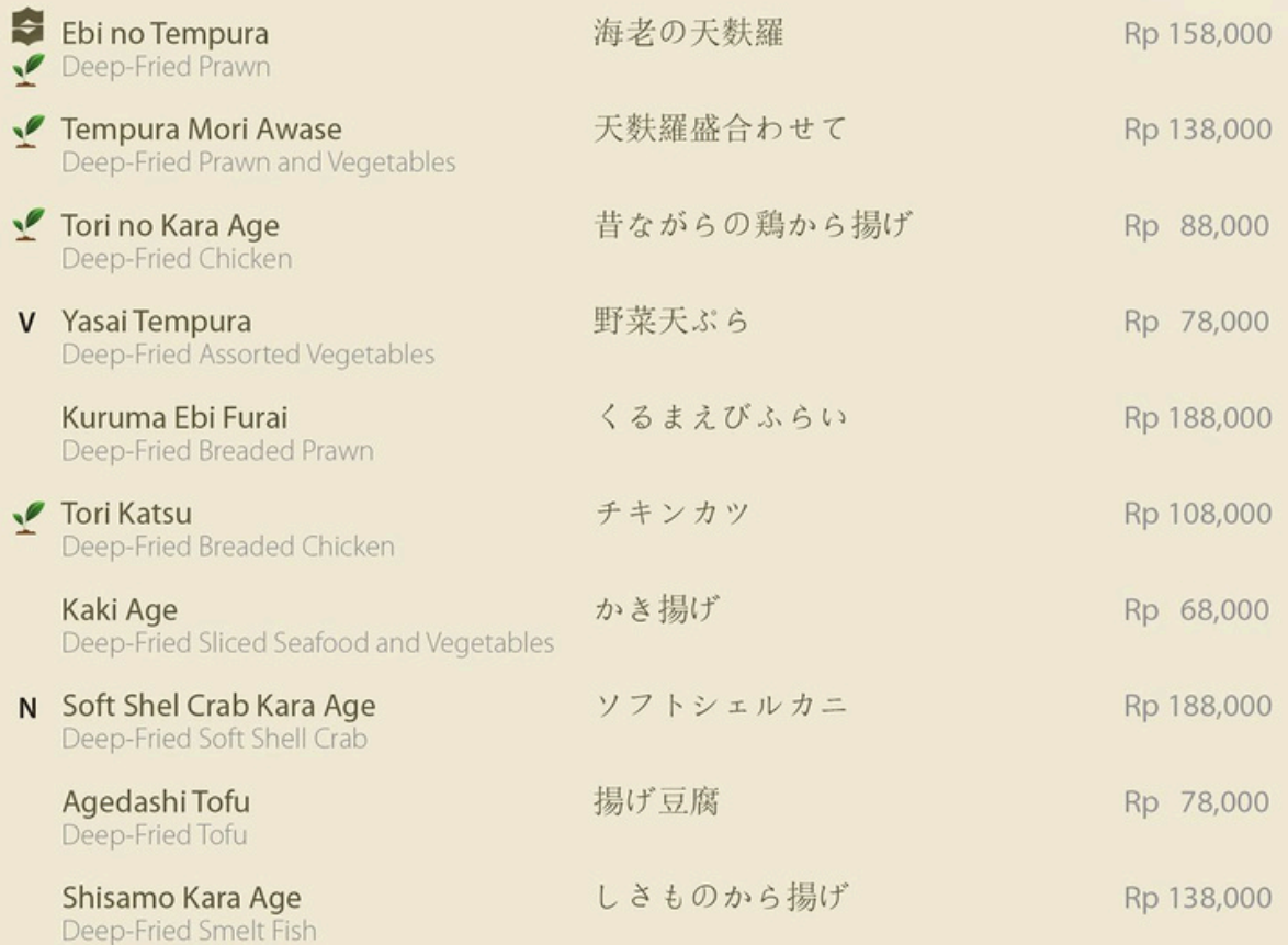
Ebi no Tempura Deep-Fried Prawn