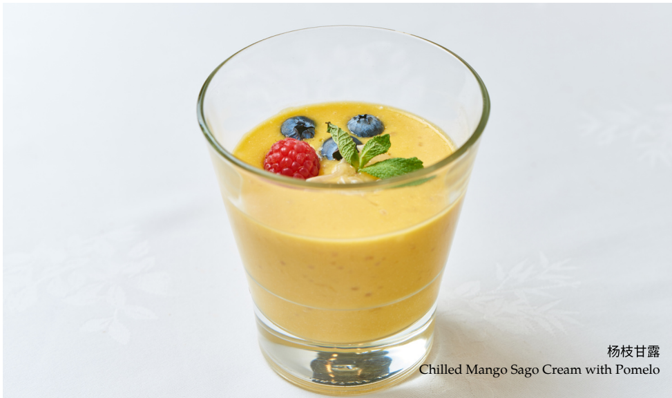
杨枝甘露 Chilled Mango Sago Cream with Pomelo