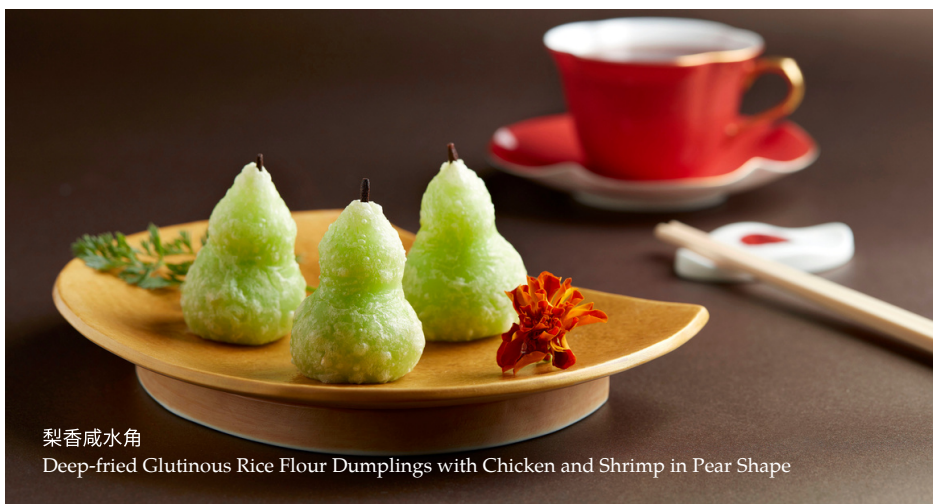
梨香咸水角 Deep-fried Glutinous Rice Flour Dumplings with Chicken and Shrimp in Pear Shape