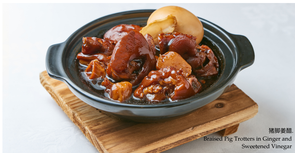
猪脚姜醋. Braised Pig Trotters in Ginger and Sweetened Vinegar