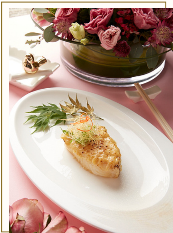
Oven Baked Cod Fillet with Japanese Miso