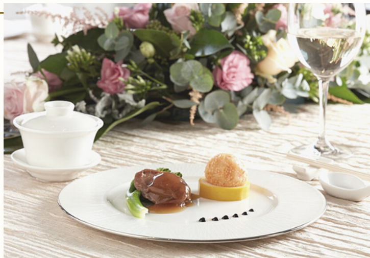
Braised 5-head Abalone with Jade Melon Ring and Shrimp Pearl