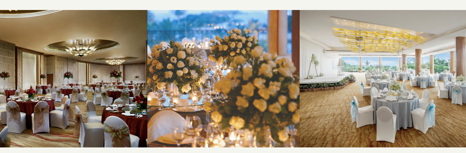
Rate is subject to 10% service charge and prevailing taxes.