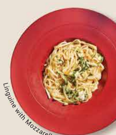
Linguine with Mozzarella

All curry symphony are served with steamed Jasmine Rice & Papadom