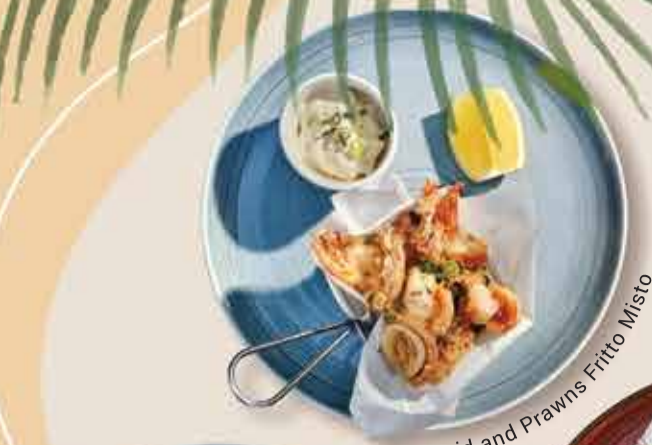
Squid and Prawns Fritto Misto