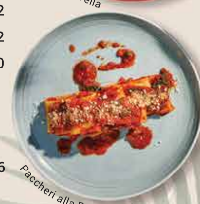
Paccheri alla Puttanesca