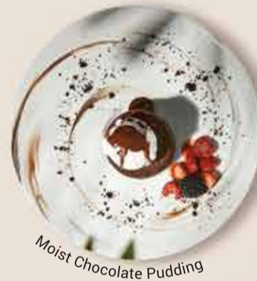
Moist Chocolate Pudding

Sauce: Café de Paris, Black Pepper Sauce, Lemon Butter Sauce, Mushroom Sauce