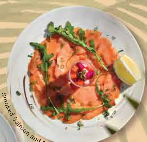
Smoked Salmon and Rocket Leaves