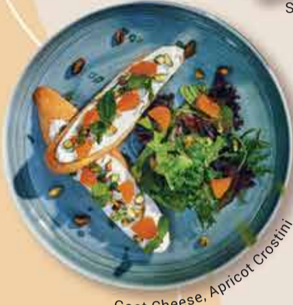
Goat Cheese, Apricot Crostini