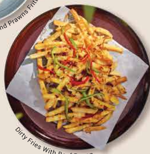
Dirty Fries With Beef Bacon