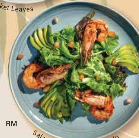
Salad with Prawns, Avocado