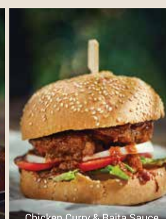
Chicken Curry & Raita Sauce