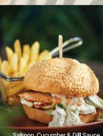
Salmon, Cucumber & Dill Sauce