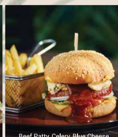
Beef Patty, Celery, Blue Cheese