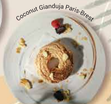
Coconut Gianduja Paris-Brest