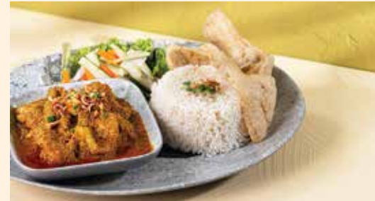
Chicken Curry Kapitan