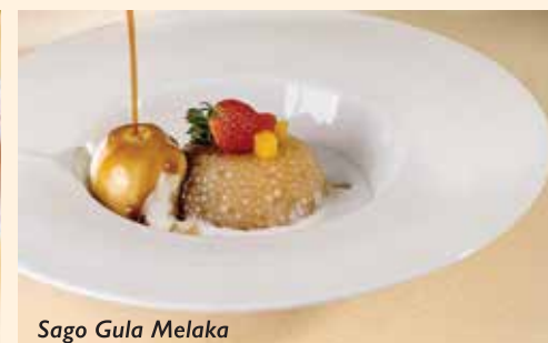
Sago Gula Melaka

Beef [N] Contains Nuts [S] Contains Seeds [M] Vegetarian Spicy (please advise if less spicy is preferred)