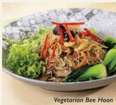
Vegetarian Bee Hoon