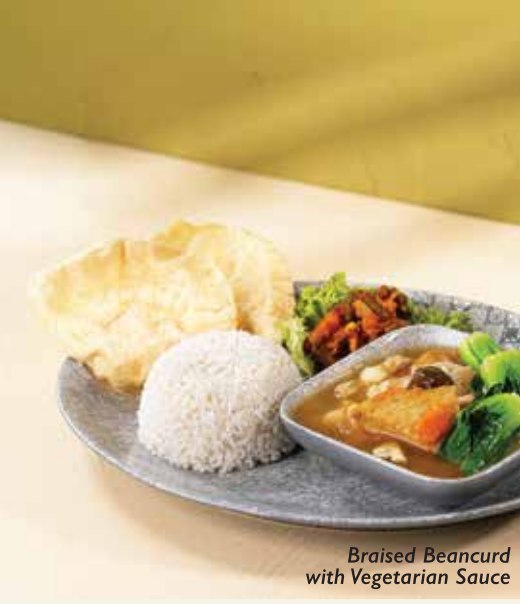
Braised Beancurd with Vegetarian Sauce