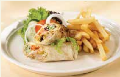
Chicken Shawarma Wrap