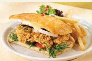
Crunchy Chicken Burger