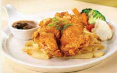
Traditional Chicken Chop