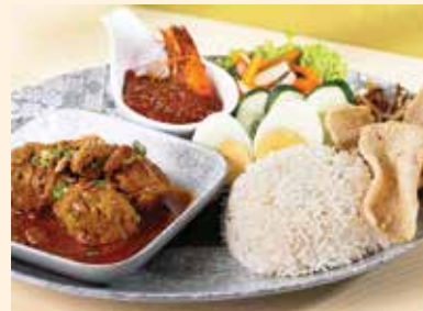
Garden Café Nasi Lemak