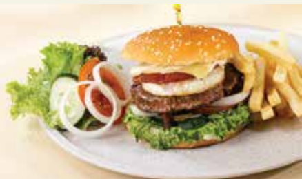
The House Burger