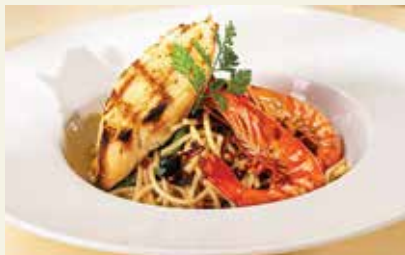
Prawn Aglio e Olio