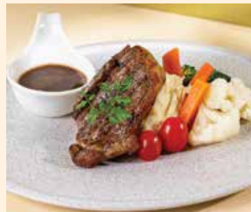
Rib Eye Steak