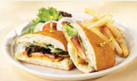
Grilled Vegetable Sandwich