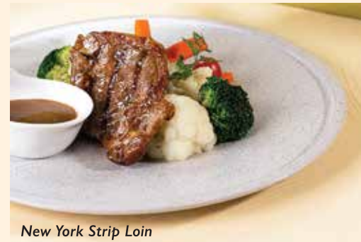
New York Strip Loin