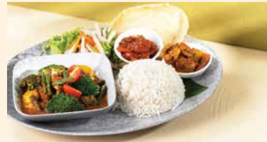
Mixed Vegetable Curry