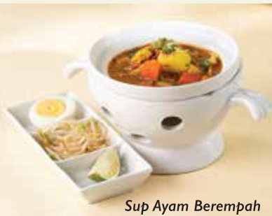
Sup Ayam Berempah