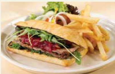
Shaved Flank Steak Ciabatta

🍷 Beef [N] Contains Nuts [S] Contains Seeds [M] Vegetarian 🌶️ Spicy (please advise if less spicy is preferred)