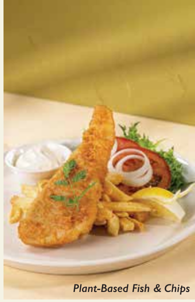
Plant-Based Fish & Chips