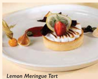
Lemon Meringue Tart