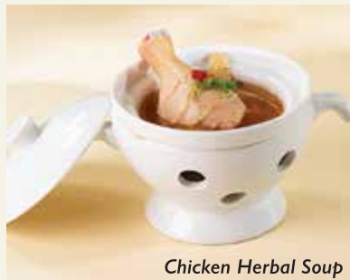
Chicken Herbal Soup