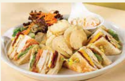
Golden Sands Club Sandwich