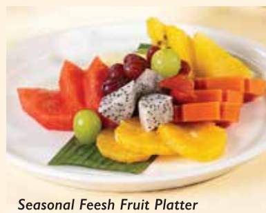
Seasonal Fresh Fruit Platter