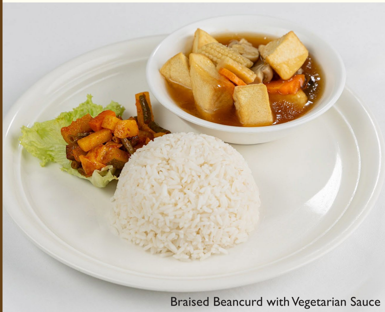
Braised Beancurd with Vegetarian Sauce