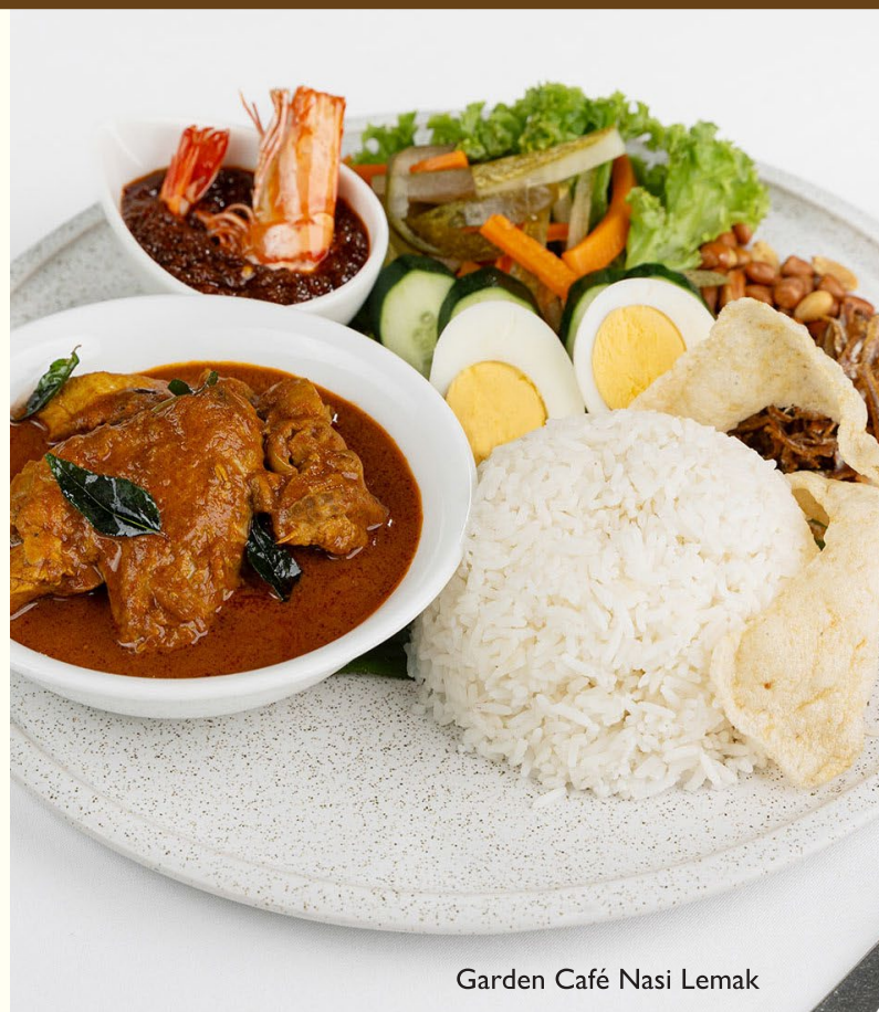
Garden Café Nasi Lemak