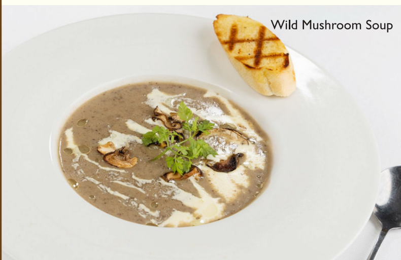
Wild Mushroom Soup