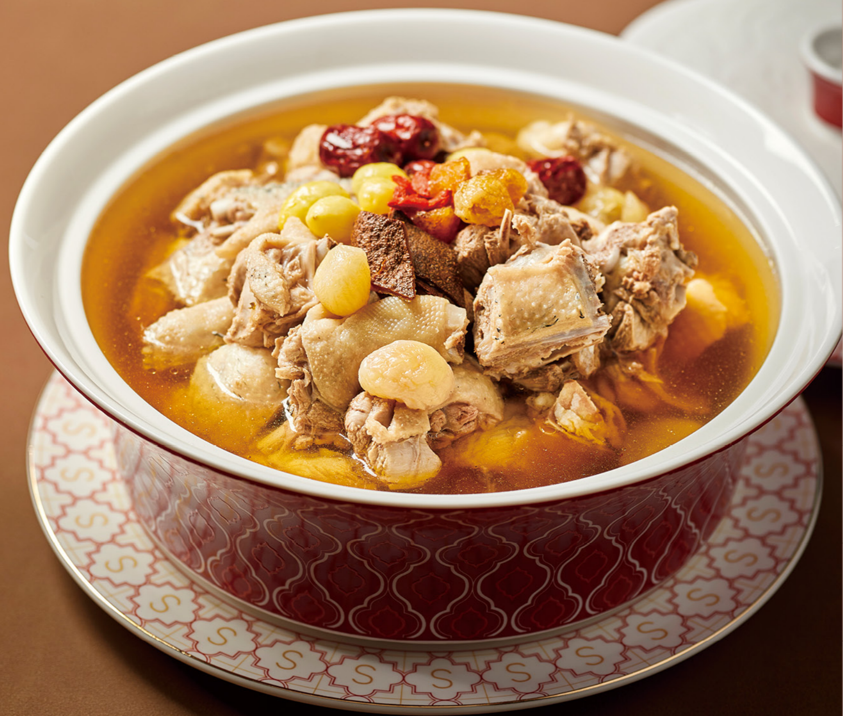
岭南三宝响螺炖水鸭 🐊🐚🍊 Stewed Duck with Conch, Red Date, Tangerine Peel and Ginkgo