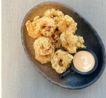
炸虾 새우 튀김-신규 RM88 330 Marinated with Lemon Spice and Spicy Mayonnaise [S] [G]