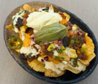
美式玉米片 아메리칸 나초-신규 RM58 218 Crispy Nachos Chips, Spicy Beef Ragout, Avocado, Olives, Pico de Gallo, Cheese Sauce, Sour Cream [D] [G]