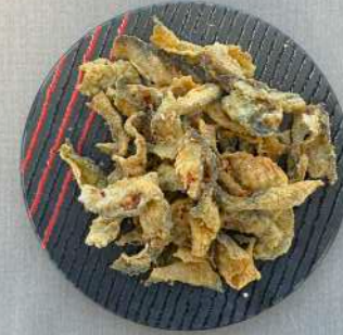
香辣脆鱼皮 매콤 바삭한 생선 껍질 RM55 206 Fried Fish Skin topped with Chili Flakes [S] [G]