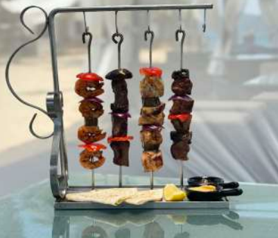
日落钩 신셋 후크 RM108 405 Lamb, Beef, Chicken and Tiger Prawn Skewers served with Grilled Onions, Tomatoes, Capsicums, Tomato Chutney, Hummus and Lemon Wedges [S] [G]