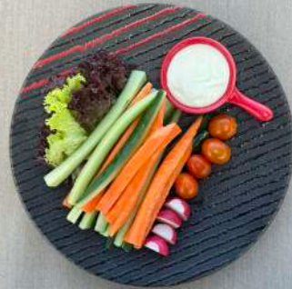
蔬菜点心 야채 크루디트 RM35 131 Cucumbers, Carrots, Celery, Tomatoes, Radish with Blue Cheese Dip [D]