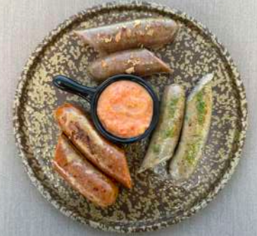
鸡,羊,牛肉香肠拼盘 트리오 뱅어 RM68 255 Grilled Chicken, Lamb and Beef Sausages with Romesco Sauce