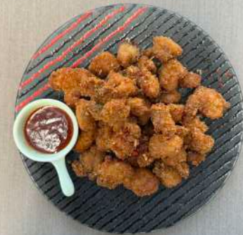
香炸辣味鸡米花 치킨 팝콘-신규 RM58 218 Marinated Cajun Spiced Chicken with Asian Barbeque Sauce [G]

Allergens: [D] Dairy [G] Gluten [N] Nuts [S] Seafood