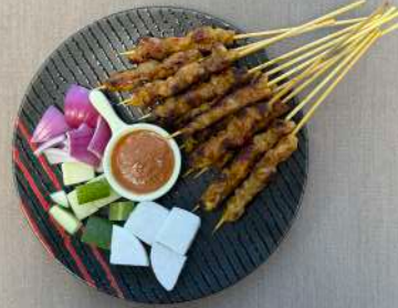
自制沙爹 - 12 件 홈메이드 사테-12개 RM68 255 Grilled Chicken and Beef Skewers, Onions, Cucumbers, Sticky Rice Cubes with Peanut Sauce [N]