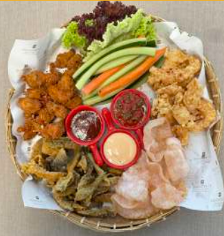
小食拼盘 플래터 세트 RM88 330 Fried Prawns, Chicken Popcorn, Vegetables Crudites, Crispy Fish Skin, and Prawn Crackers [S] [G]