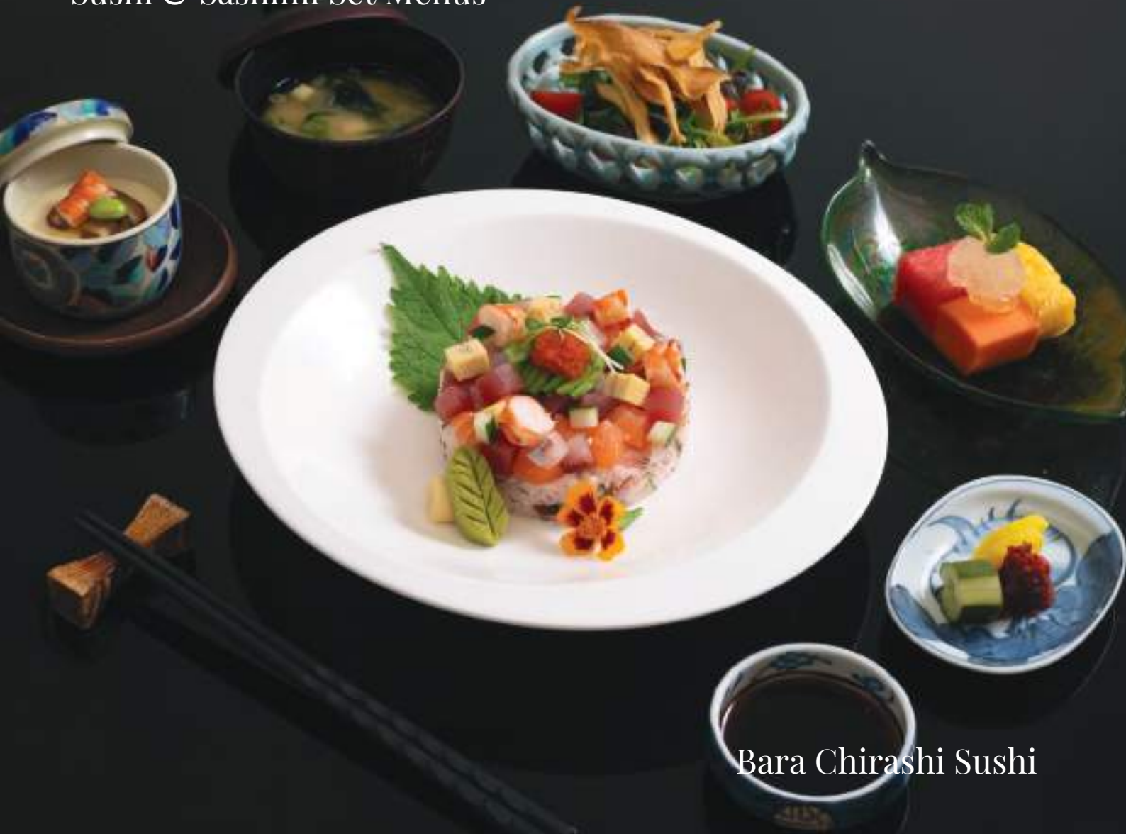
Bara Chirashi Sushi

バラちらし寿司 Bara Chirashi Sushi Assorted Sashimi and Tobiko on Sushi Rice