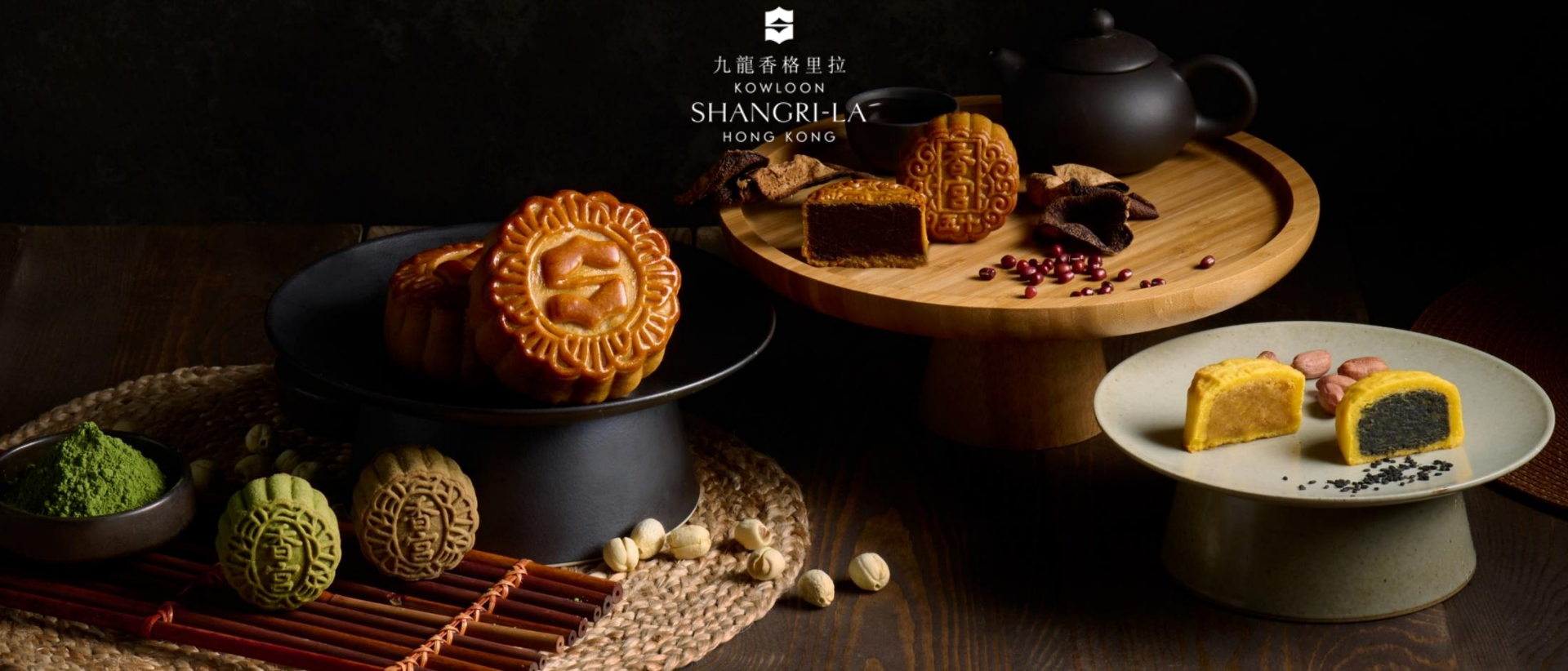
九龍香格里拉 香宮米芝蓮星級中秋月餅及禮物籃 SHANG PALACE MICHELIN-STARRED MID-AUTUMN FESTIVAL MOONCAKES AND HAMPERS KOWLOON SHANGRI-LA, HONG KONG