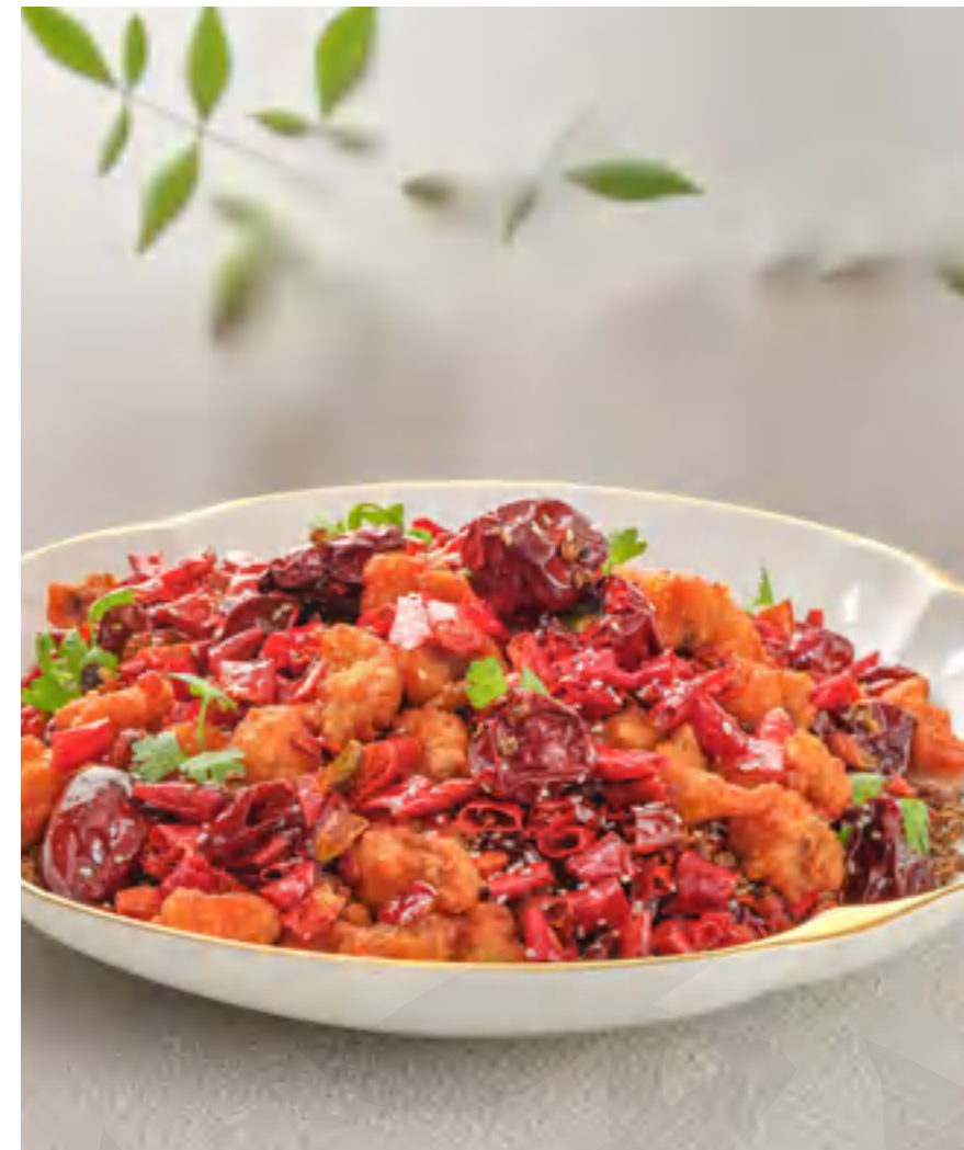
🐔 香酥红袍辣子鸡 ¥128 /例 Crispy Chicken with Chili