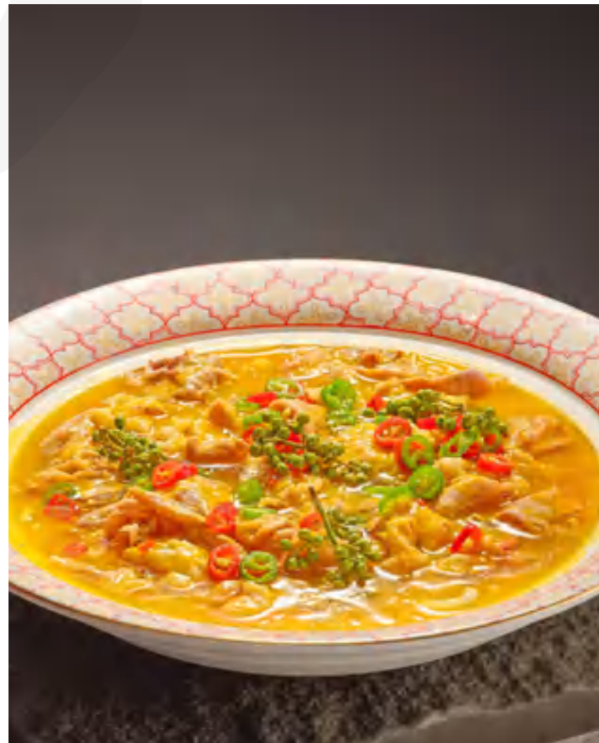
🐮 川椒金汤煮肥牛 ¥268 /例 Boiled Beef with Sichuan Pepper and Mushrooms