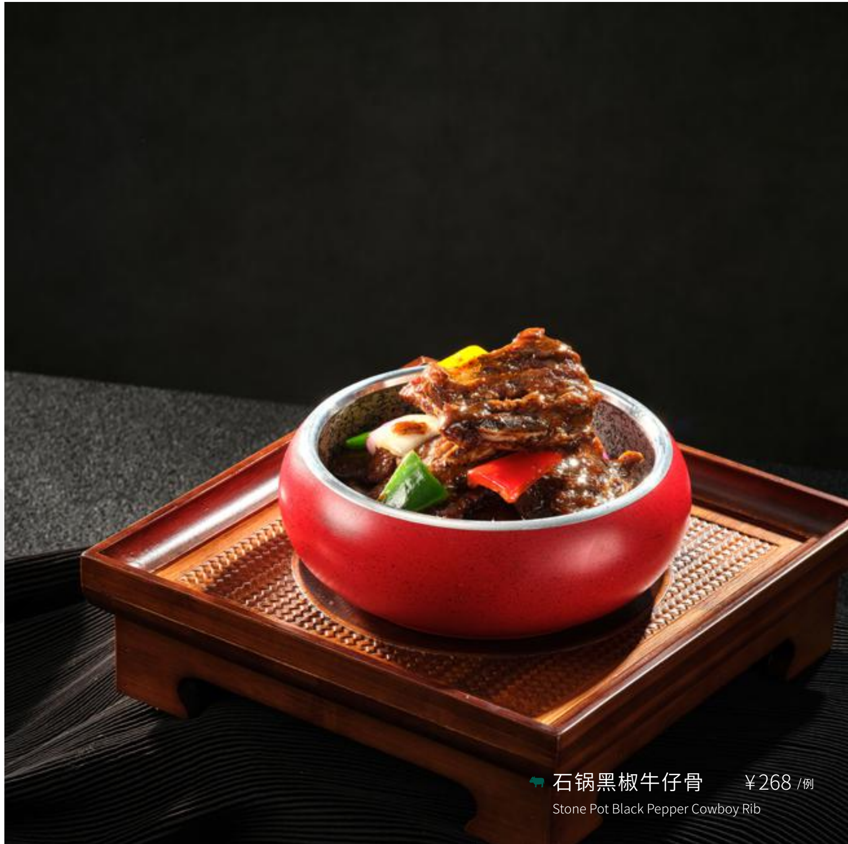
石锅黑椒牛仔骨 Stone Pot Black Pepper Cowboy Rib ¥268 / 例