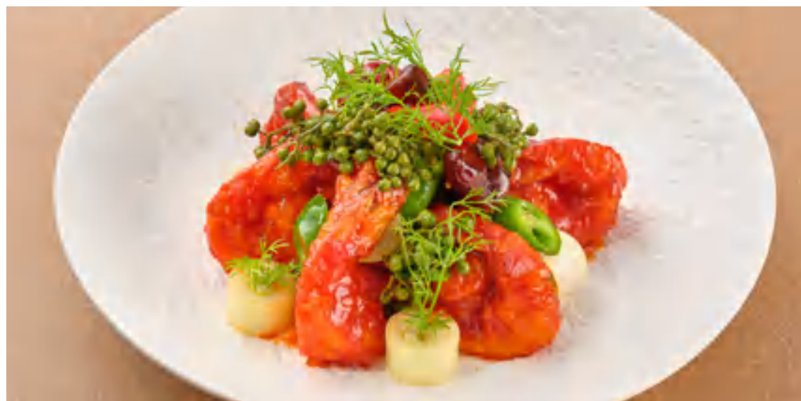
鲜椒宫爆明虾球 Kung pao Shrimp Balls with Sweet chili ¥ 268 / 例