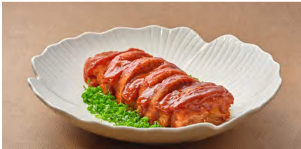
客家香芋扣腩肉 Hakka Steamed Pork Belly with Taro ¥168 / 例