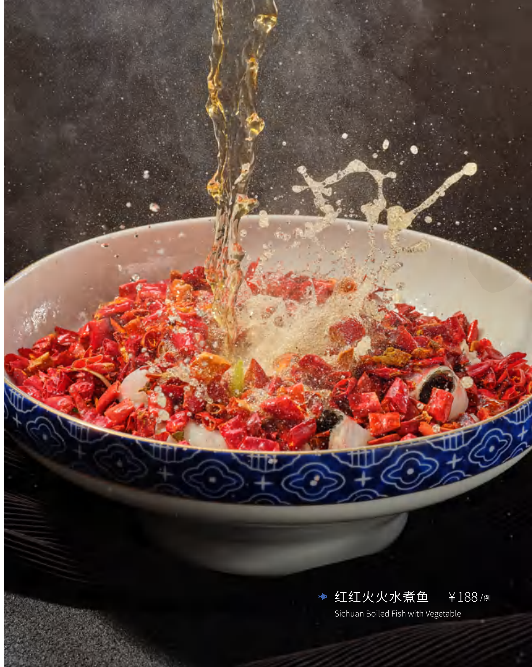
👉 红红火火水煮鱼 ¥188 /例 Sichuan Boiled Fish with Vegetable