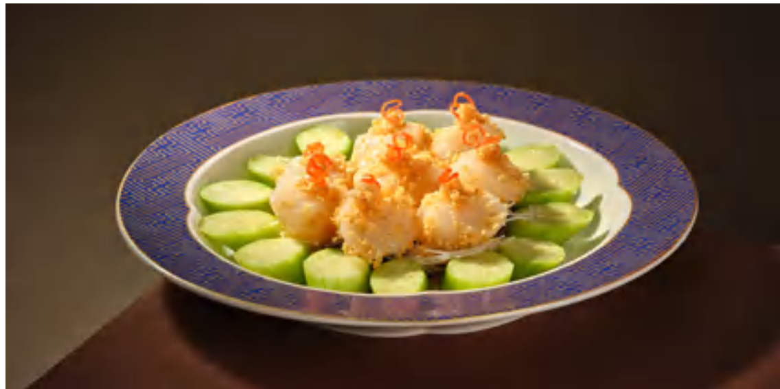
金蒜胜瓜蒸元贝 Stewed Scallops with Loofah and Fried Garlic ¥188 / 例