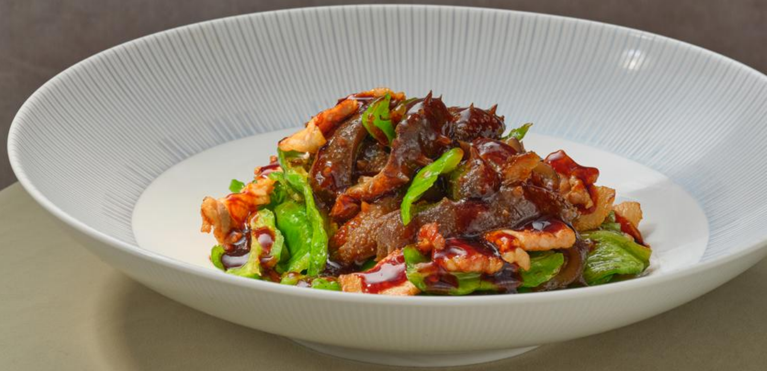
👉 麻椒海参炒五花 ¥588/例 Sichuan Pepper Stir-Fried Pork Belly with Sea Cucumber