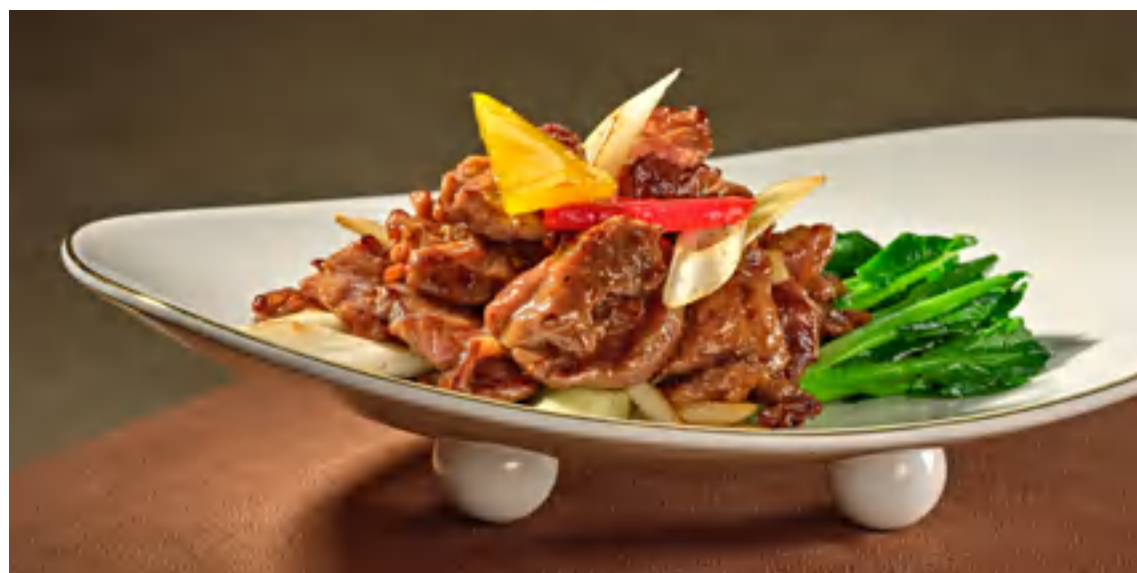
姜葱爆炒羊腿肉 Stir-fried Lamb Leg with Ginger and Scallions ¥ 188 / 例