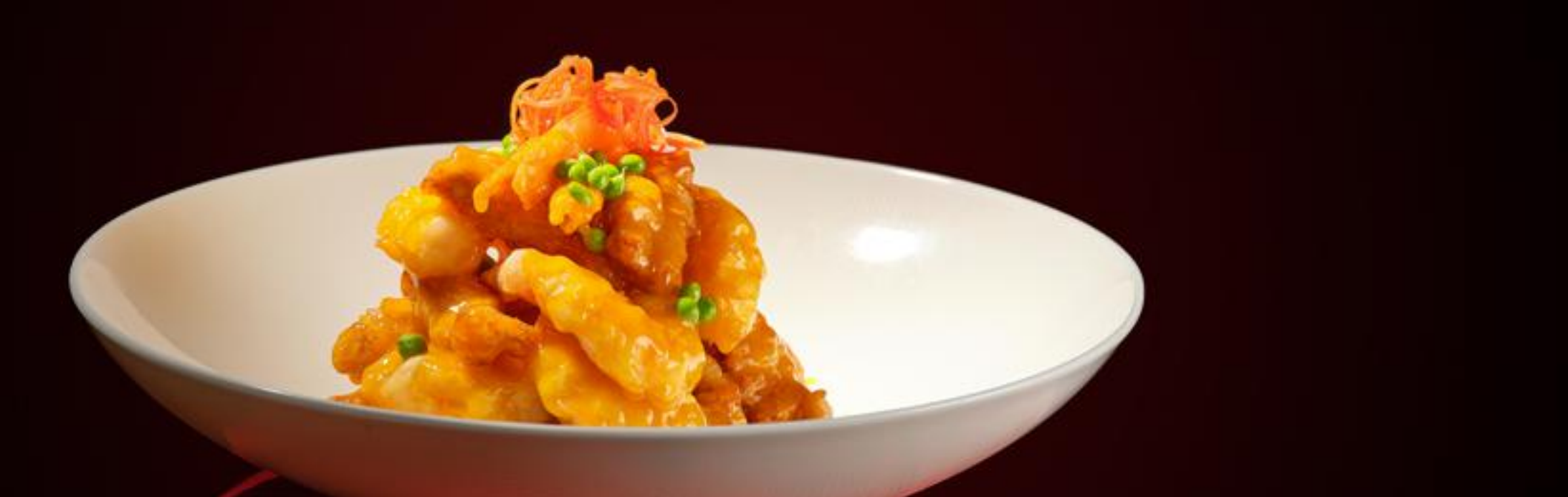
👉 焦溜双段手扒虾 ¥128/例 Fried Shrimp Slices with Sweet and Sour Sauce