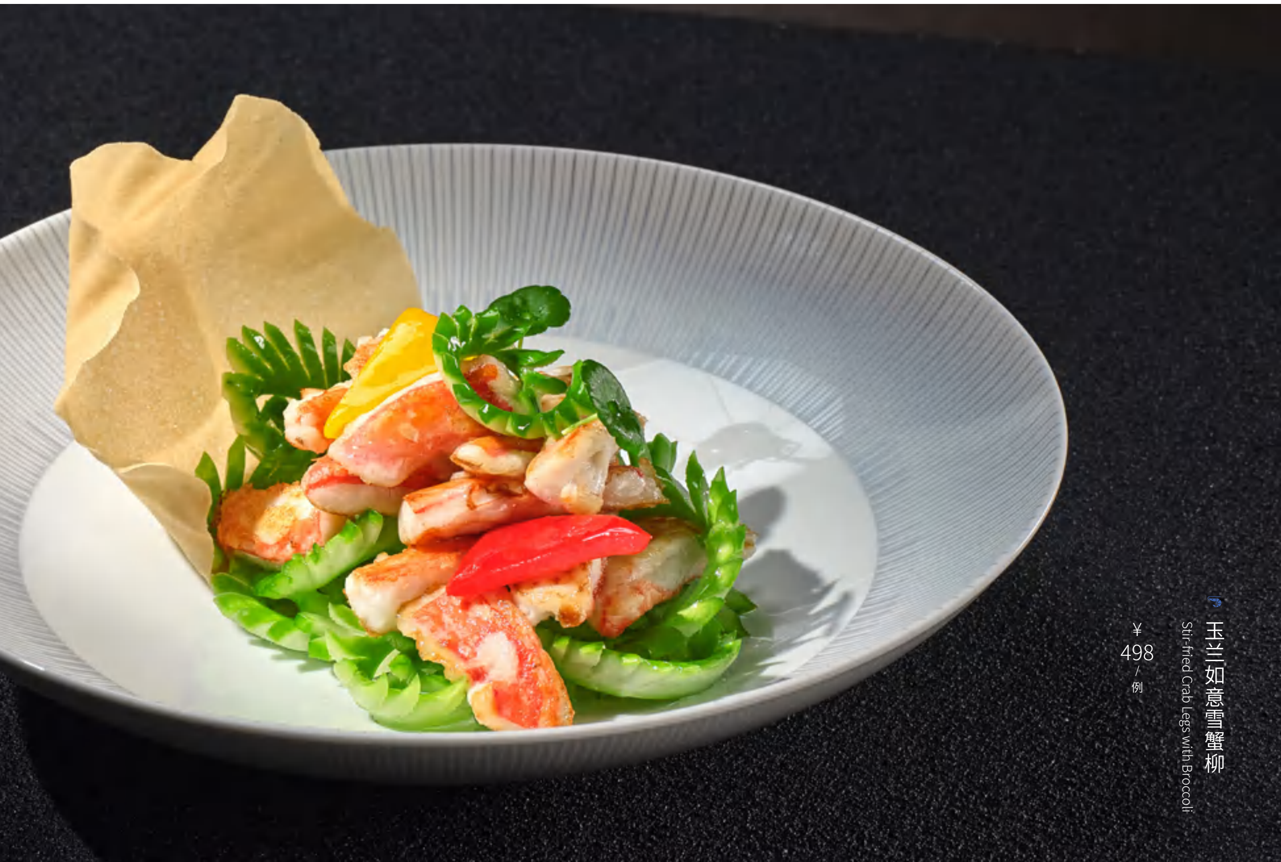
玉兰如意雪蟹柳 Stir-fried Crab Legs with Broccoli ¥ 498 / 例