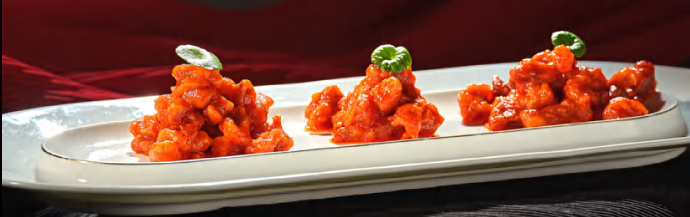
🐷 大连特色樱桃肉 ¥88/例 Dalian Specialty Cherry Pork