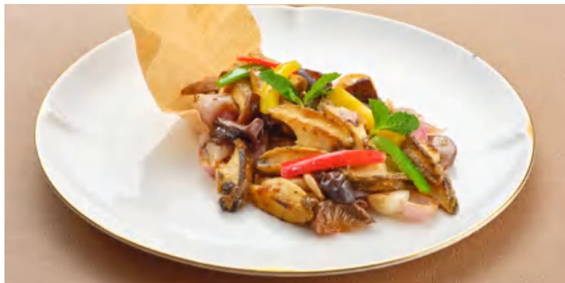
红葱山菌啫鲍鱼 Braised Abalone with Scallions and Mushrooms ¥ 298 / 例