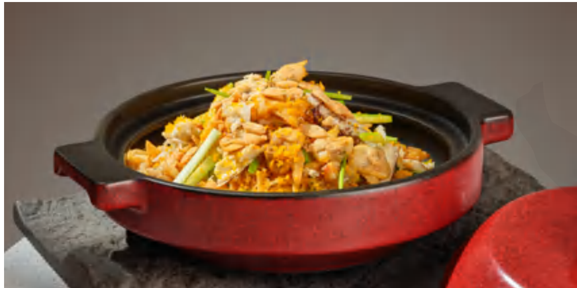
白贝节瓜粉丝煲 Stewed Scallop Vermicelli with Zucchini ¥128 / 例