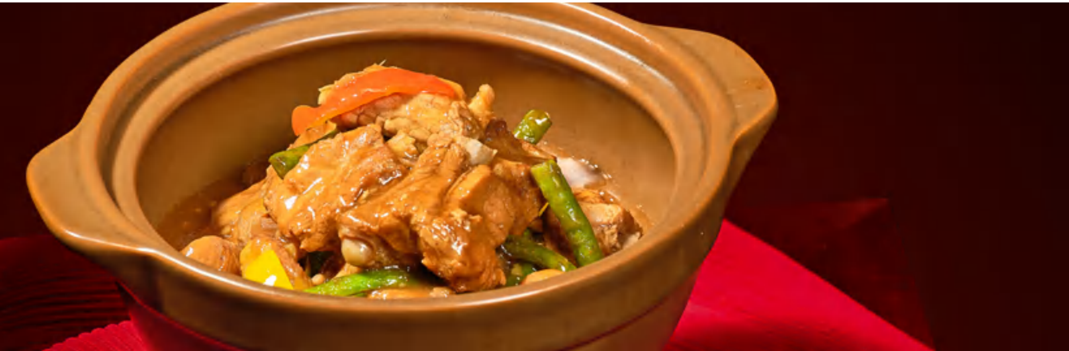
🐷 板栗芸豆炖排骨 ¥168/例 Braised Pork Ribs with Chestnut and French Beans