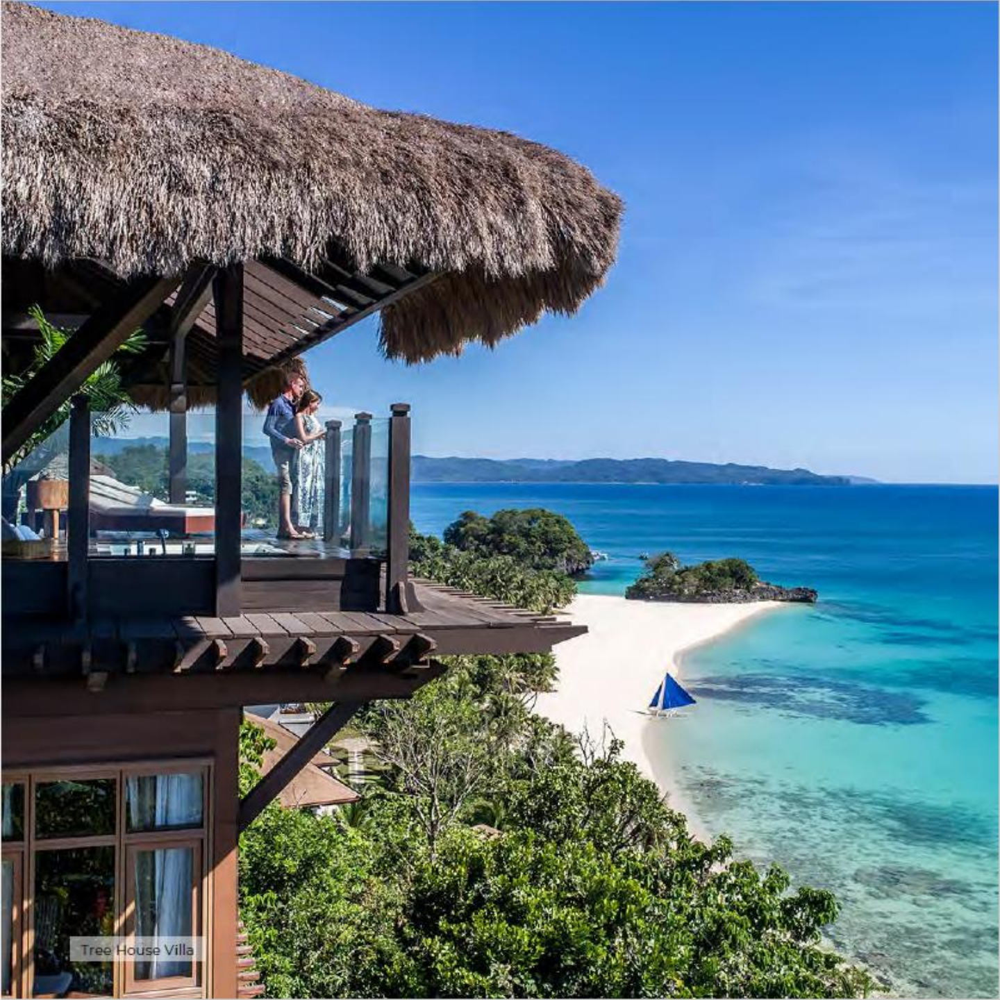
Tree House Villa