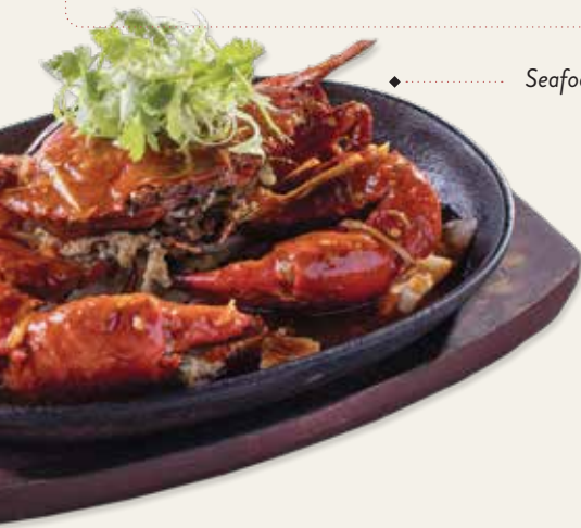
◆ ..... Seafood Sizzlers - Mud Crab