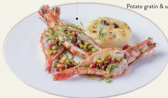
Butterfly King Prawns