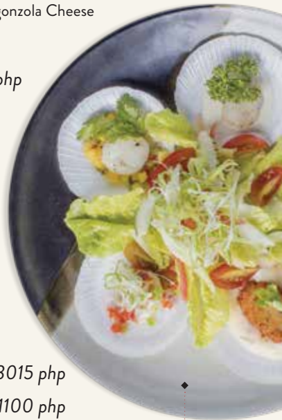
Philippine Sea Scallops, Served Five Ways

Squid, scallops, prawn and glass noodles, aromatic Thai dressing