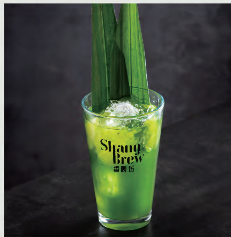
椰香斑斓 Panda Leaf Coconut Milk