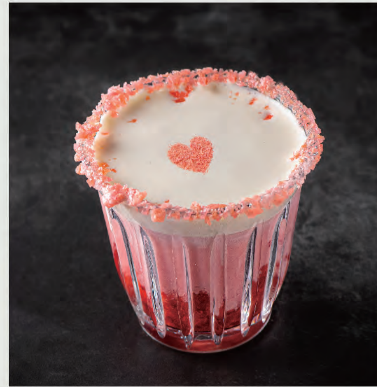
爆炸甜心 48 Dirty Pink