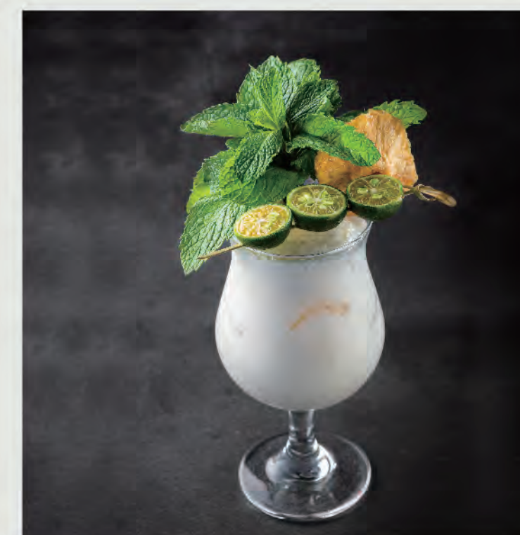
啤啤椰林飘香 Beer Pina Colada 78