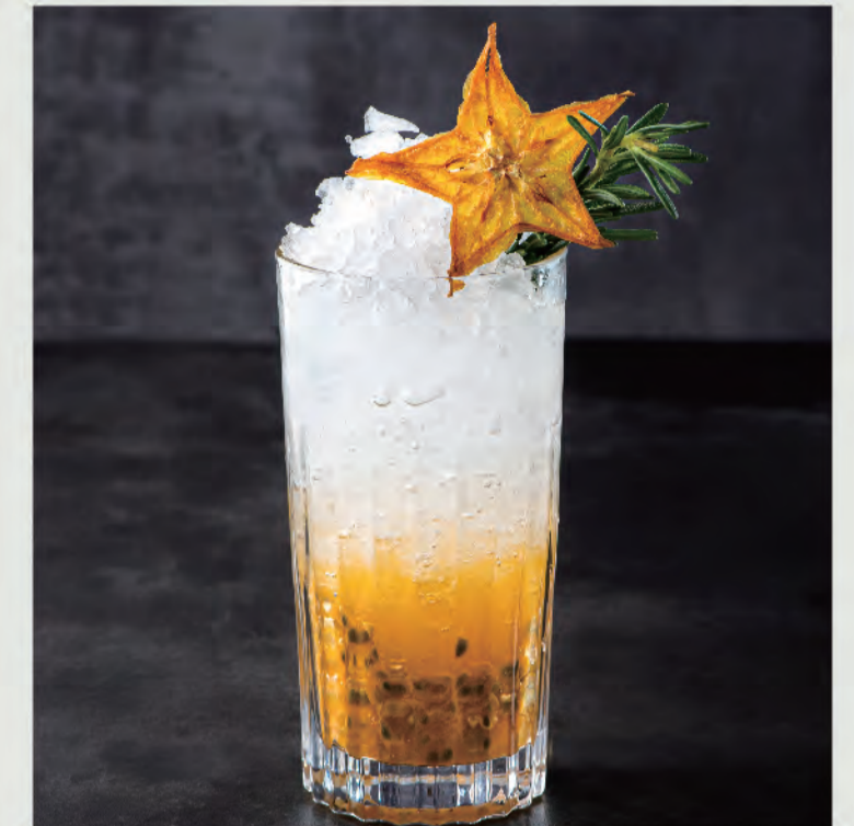
百香果柠檬苏打 38 Passion Fruit Lemonade