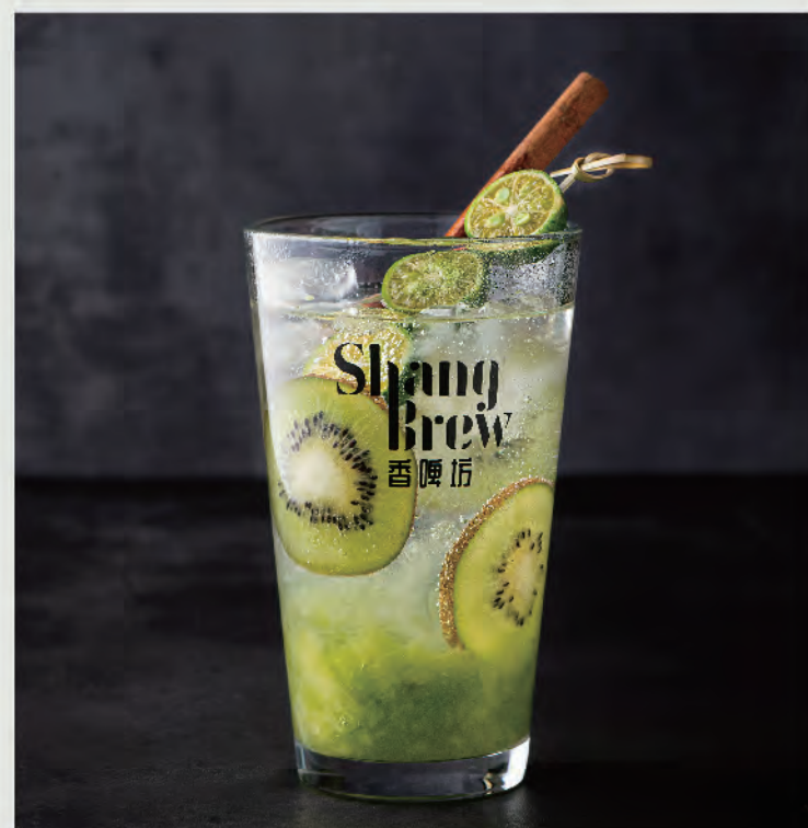
泡泡奇异果 Bubble Kiwi