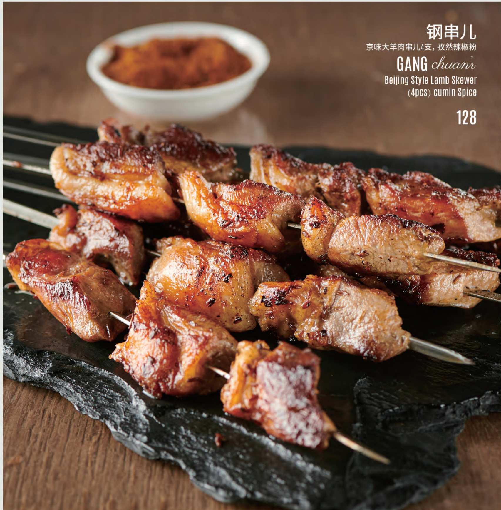
钢串儿 京味大羊肉串儿4支, 孜然辣椒粉 GANG chuan'er Beijing Style Lamb Skewer (4pcs) cumin Spice