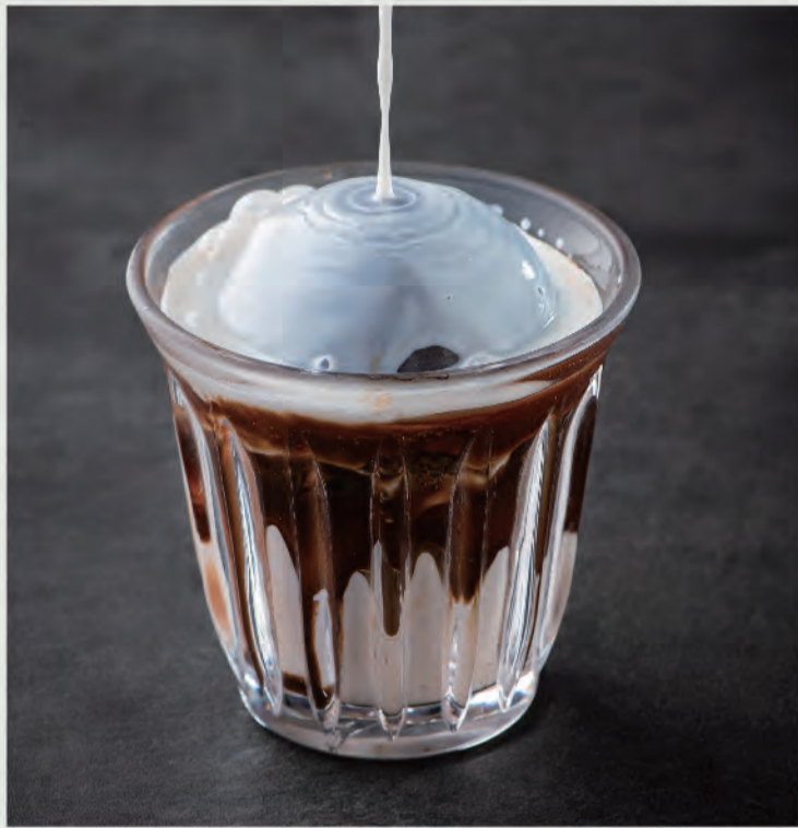
圆滚滚冰球海盐拿铁 48 Coffee Hockey Sea Salt Latte