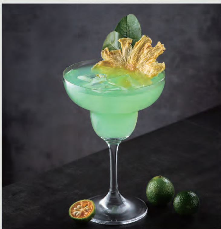
仲夏夜之梦 A Midsummer Night's Dream