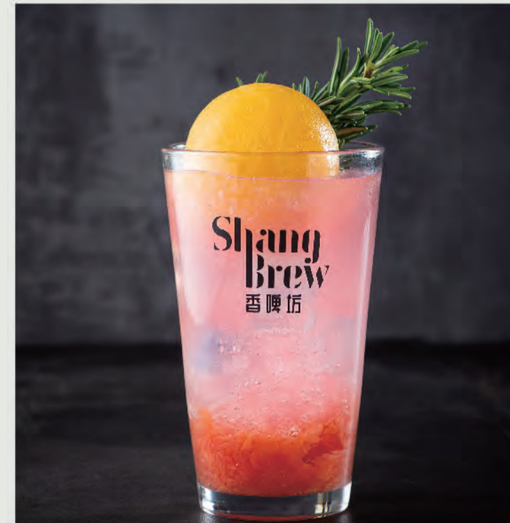
西柚汽水 38 Grapefruit Fizzy