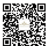
微信公众号 WeChat Official Account