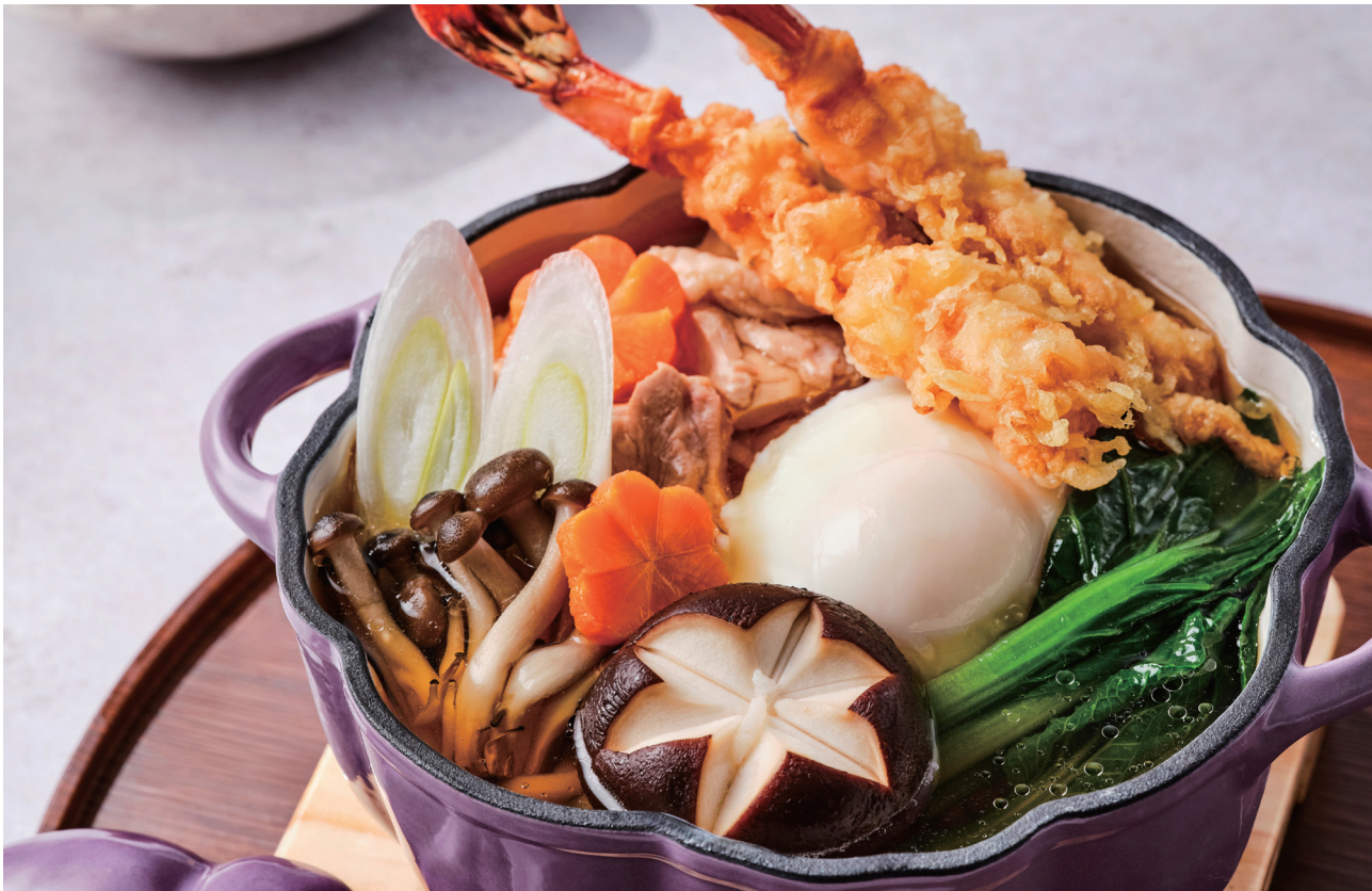
锅烧乌冬面 (S) (G) Nabeyaki Udon 天妇罗虾，鱼饼，乌冬面，蔬菜 Tempura Prawn, Fish Cake, Udon, Vegetables RMB 158