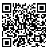
小红书 Red Book