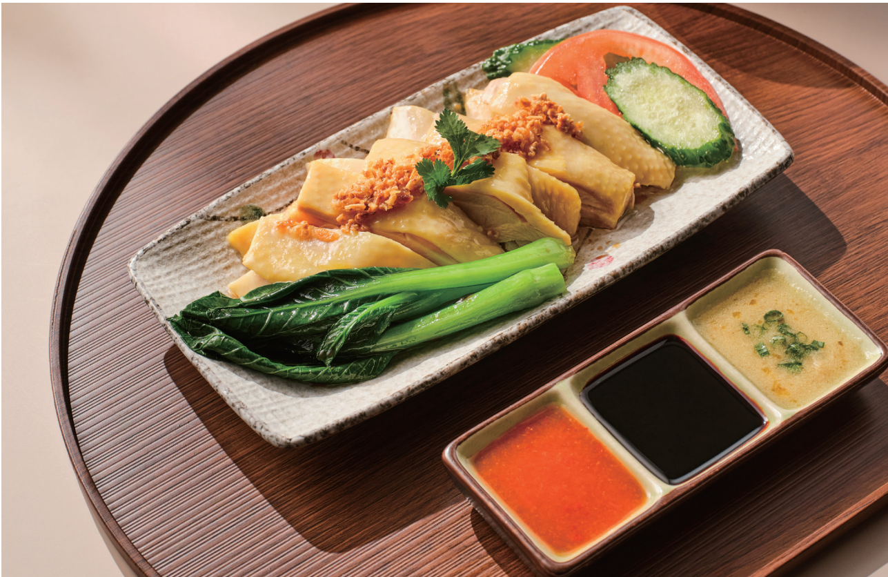
☆ 海南鸡饭 (G) Hainan Chicken Rice 鸡腿和鸡胸肉，鸡汤，香米饭，春葱油 Poached Chicken Thigh and Chicken Breast, Chicken Broth, Fragrant Rice, Spring Onion Oil RMB 158