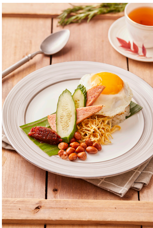
马来椰浆饭 (S,E,N) 配叁芭酱、鸡蛋、炸小咸鱼和花生 Nasi Lemak Malaysian-style coconut rice with homemade sambal sauce, fried egg, crispy anchovies and roasted peanuts