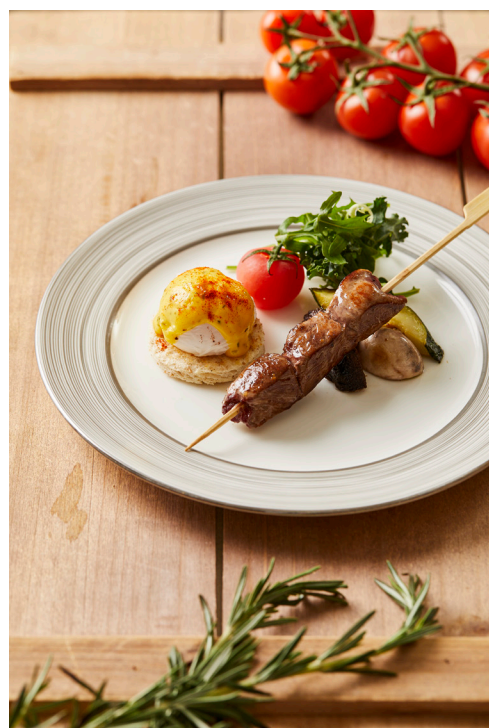
日式煎牛里脊串 (G,E) 配水波蛋 Yakitori-style Beef Served with poached egg

(B) 含豆类 Beans included (D) 含奶制品 Dairy included (E) 含鸡蛋 Eggs included (G) 含谷物 Grain included (N) 含果仁 Nuts included (S) 含海鲜 Seafood included