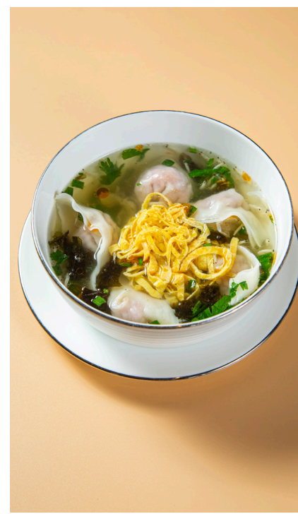
北京蛋丝小馄饨 (G,E,S) 猪肉馄饨配虾皮、 紫菜、香菜 Beijing Street Wonton Served with dried shrimp, seaweed, coriander 酥油饼夹金枪鱼 (G,E) 黄瓜、法式蛋卷和芝麻生菜 Tuna Pancake Sandwich Served with cucumber, omelette and arugula

(B) 含豆类 Beans included (D) 含奶制品 Dairy included (E) 含鸡蛋 Eggs included (G) 含谷物 Grain included (N) 含果仁 Nuts included (S) 含海鲜 Seafood included