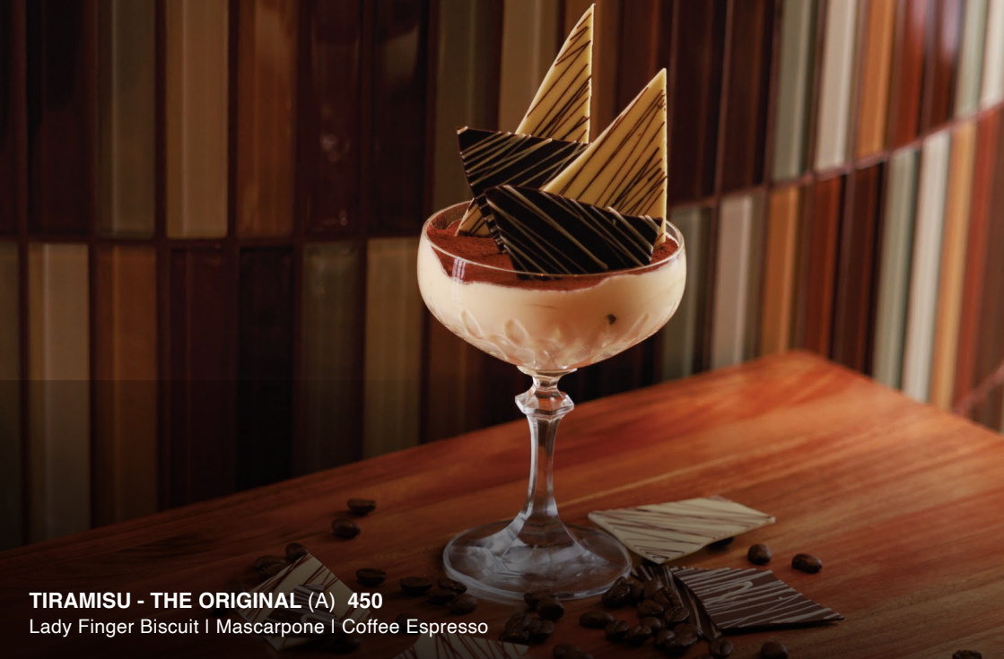
TIRAMISU - THE ORIGINAL (A) 450 Lady Finger Biscuit | Mascarpone | Coffee Espresso