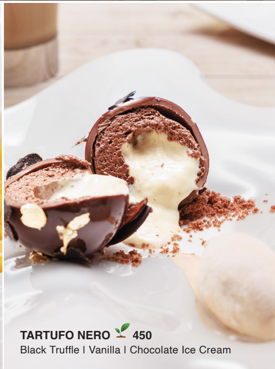
TARTUFO NERO 🌿 450 Black Truffle | Vanilla | Chocolate Ice Cream