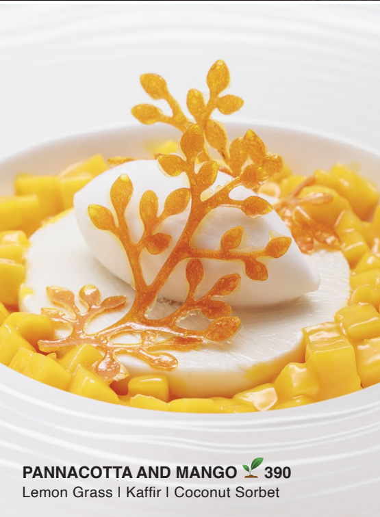
PANNACOTTA AND MANGO 🌿 390 Lemon Grass | Kaffir | Coconut Sorbet